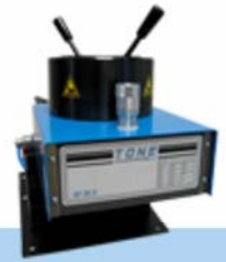
Hose cutting machine AHP 35